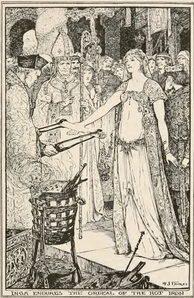
INGA ENDURES THE ORDEAL OF THE HOT IRON